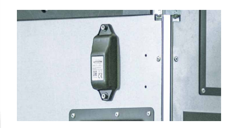
With optional tracker

The roll cages can also be integrated into an asset tracking system for seamless monitoring. Contact us!