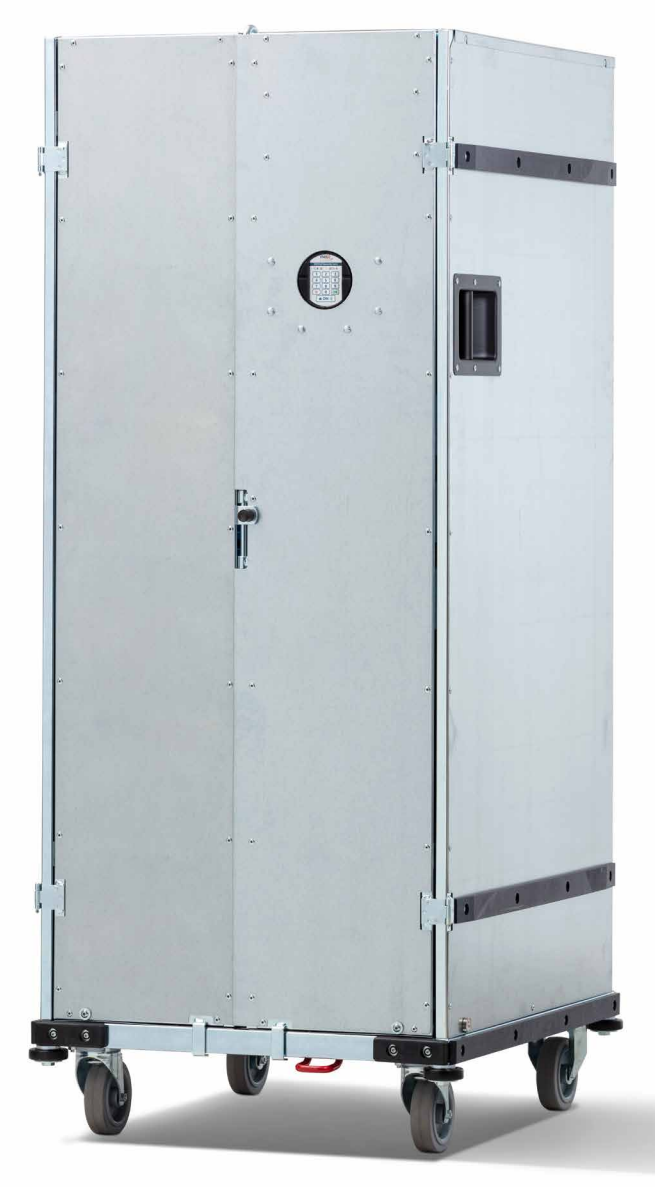
SMART & SECURE TROLLEY