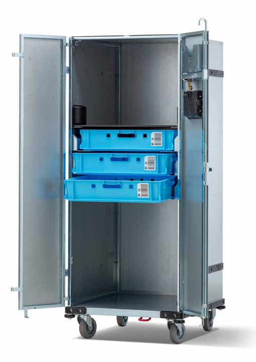
DESIGN WITH WOODEN SHELF AND THREE DRAWERS